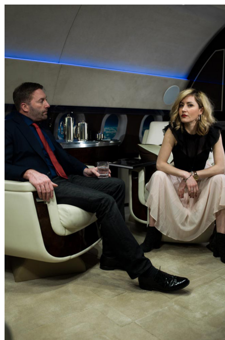
The Elite London shoot at The Jet Business for The Elite London private aviation exhibition