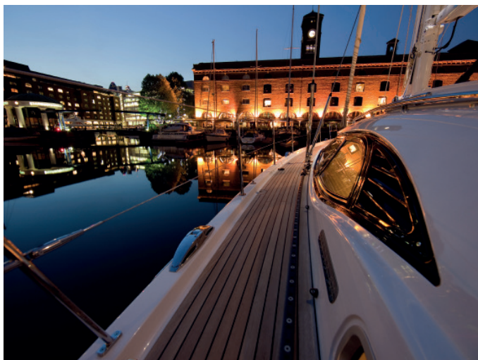
London Yacht, Jet and Prestige Car Show shoot

The content of each edition follows two main themes: Editorial and Practical. Our Editorial content covers a broad range of categories — interviews with celebrities, cultural icons, political personalities, and articles on art, design, fashion, jewellery, home interiors, gastronomy, real estate and automotive. Our Practical content covers guides and recommendations on the finest products and services — such as restaurants, hotels, shopping destinations, medical, cosmetic, schools, yachts and car rentals.