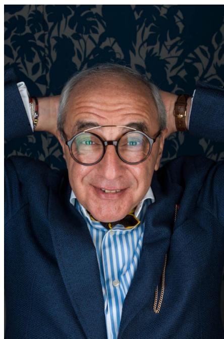
Celebrity lawyer Alexander Dobrovinsky for the Russian Roulette interview