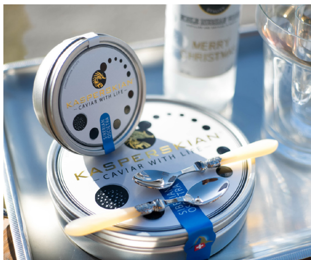
Kasperskian caviar, the only osicetra caviar produced in Switzerland, experience with RR