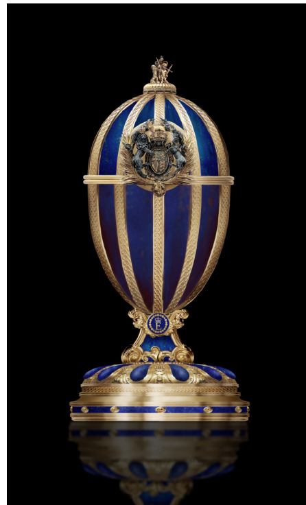
Giberg, The Royal Jeweller article