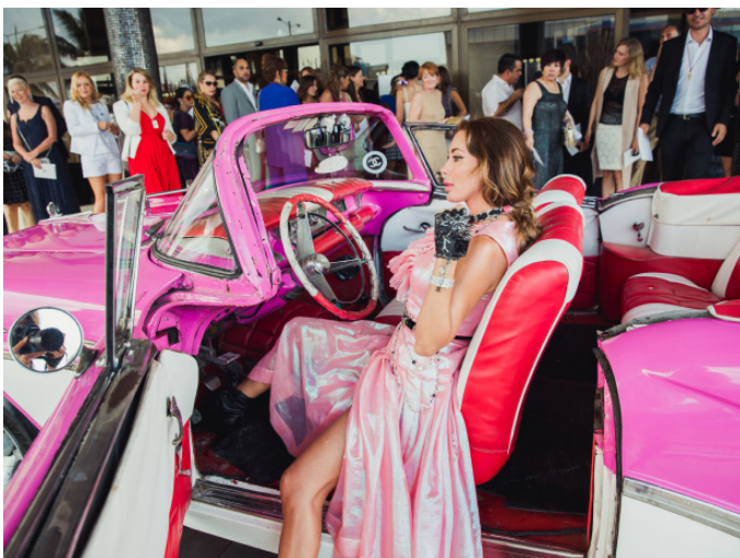
Svetlana Hant shot during the Cruise 2016 /17 Chanel show in Cuba